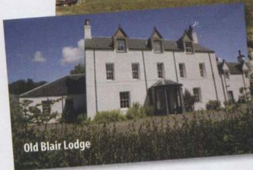
Old Blair Lodge